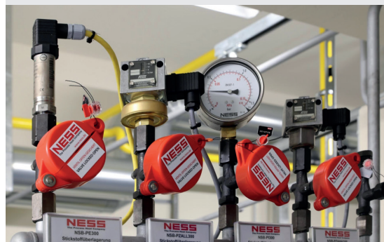
Connected nitrogen blankets