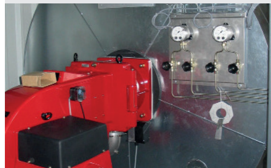
Heater with Argon Fire Extinguishing System