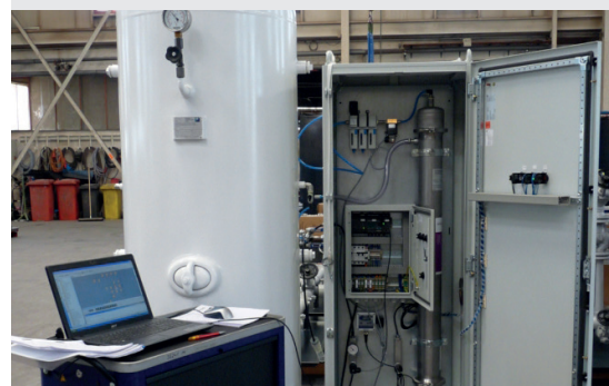
Open Nitrogen Generator