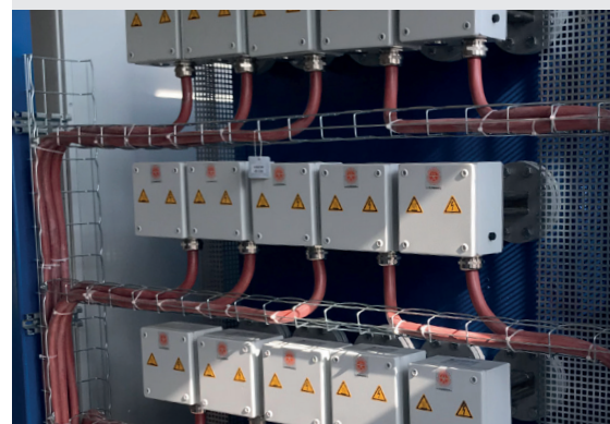
Heating flanges of EWE with 50 kW each