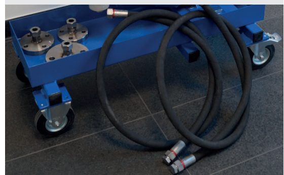
Connection side with flange connections and up to 4 m pressure side hose pipe.