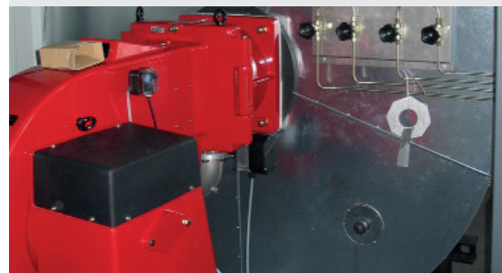
Heater prepared for Inert Gas Fire Extinguishing System (NEA)